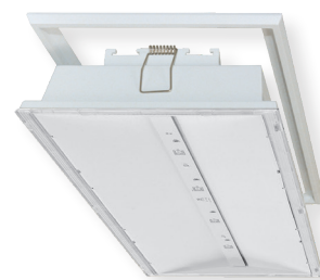
Recessed installation frame

Technische Änderungen vorbehalten/Technical changes reserved