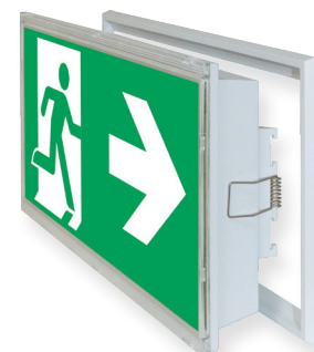
Recessed installation frame